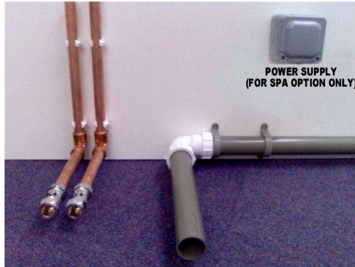
(Photograph for illustration purposes only)

It is important that the installer is made aware of the location of water stop cocks and mains electric RCD/trip switch on arrival to the property.