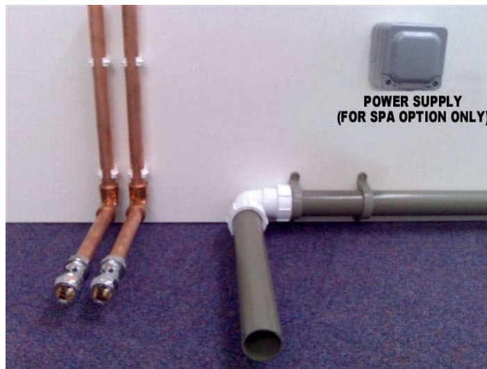
(Photograph for illustration purposes only)

It is important that the installer is made aware of the location of water stop cocks and mains electric RCD/trip switch on arrival to the property.