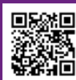
Video: click or scan to watch

I can see the benefits of the Gainsborough baths. They are user-friendly and provide a pleasant bathing experience. The hi-lo function is a big health and safety benefit for our staff.