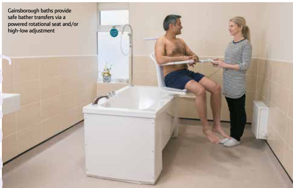
Gainsborough baths provide safe bather transfers via a powered rotational seat and/or high-low adjustment