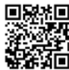
Video: click or scan to watch

On the other hand, when we place her in the bath, she smiles - which is lovely for her and us. This lady has been at Marbrook for nearly a year now and I believe being able to have frequent baths has been beneficial for her. Not only does she seem to enjoy them but having a bath benefits her muscles which are normally very tight. We have found the bath an ideal place to help her stretch out her arms and legs, and because she is relaxed and safely immersed in warm water, her muscles loosen up as a result.