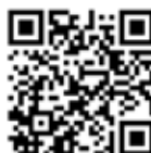
Video: click or scan to watch

The Gainsborough bath is far more advanced than the average domestic bath used elsewhere, providing real advantages for patients with higher dependency and needs as well as for their carers. For instance, as the bath has access on both sides, you can properly support a person with one-sided weakness which is crucial. The Gainsborough bath provides 360-degree access which is really important when caring for, and engaging with, a service user.