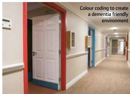
Colour coding to create a dementia friendly environment