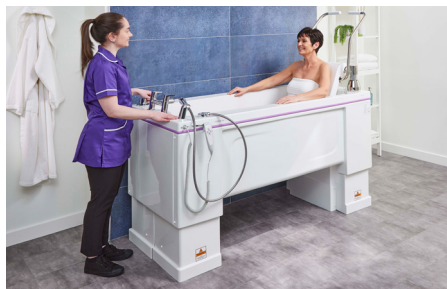
Bath can be raised or lowered to the optimum working height for carers