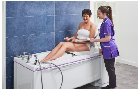
Unique leg-lift facility support the bather into and out of the bath