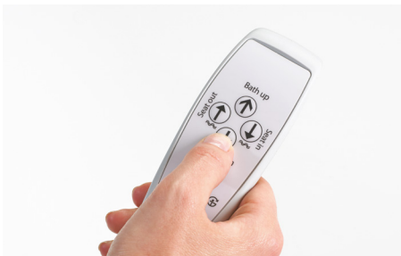
Lightweight, ergonomic handset with battery back-up system