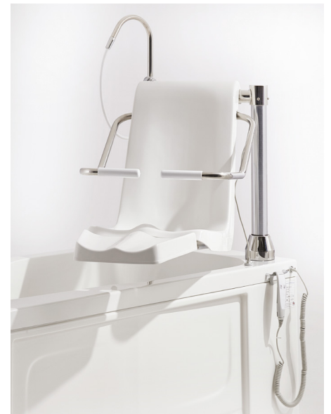
Leg lift option