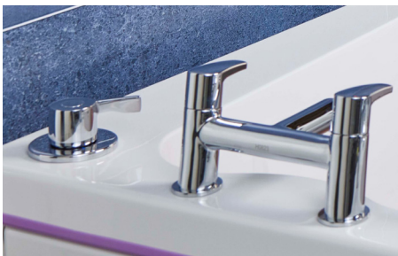
TMV3 water temperature controls reduces risk of scalding