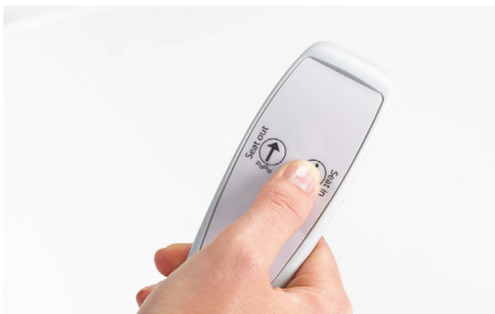
Lightweight, ergonomic handset with battery back-up system