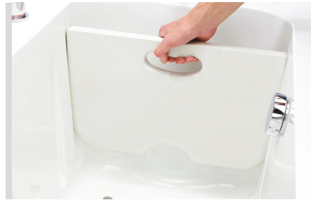
Two position footboard customises the bathing experience