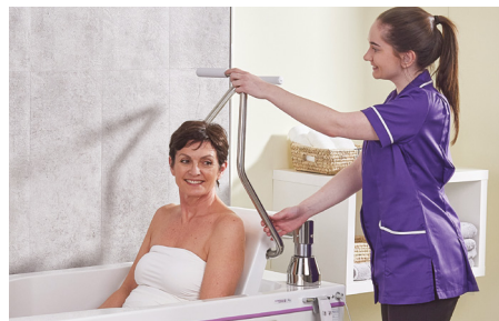
Folding nursing armrests for enhanced client safety