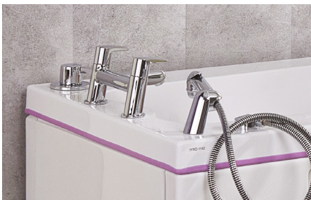
TMV3 water temperature controls reduces risk of scalding