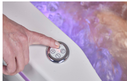
Hydrotherapy air-spa system