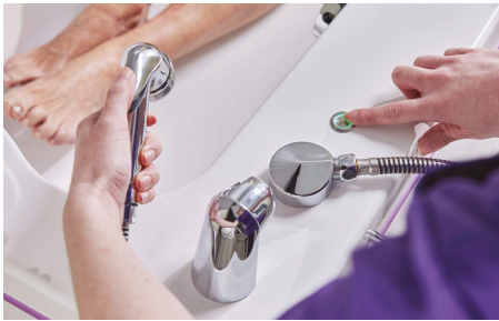
Lightweight, ergonomic hand operated shower unit option