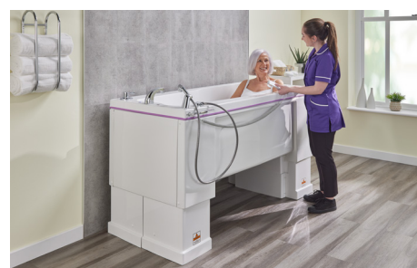
Bath can be raised or lowered to the optimum working height for carers