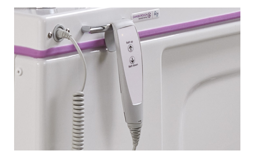
Lightweight, ergonomic handset with battery back-up system