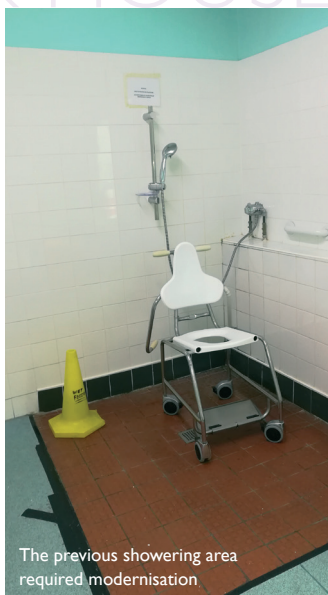
The previous showering area required modernisation