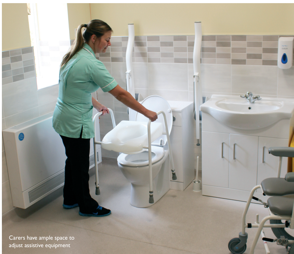
Carers have ample space to adjust assistive equipment

Manager, decided Gainsborough was the ideal supplier to implement the project in terms of quality, time-scale and budget.