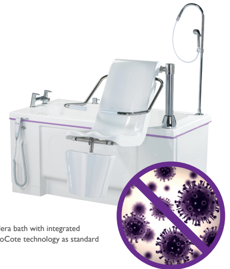
Alera bath with integrated BioCote technology as standard

The control of healthcare-associated infections (HCAIs) remains a challenge for care home providers. This involves employing a combination of infection prevention and control strategies, including hand hygiene, cleaning, training and the adoption of new technologies, to tackle the problem.