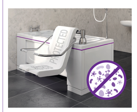
Integral antimicrobial protection will not allow microbes to survive