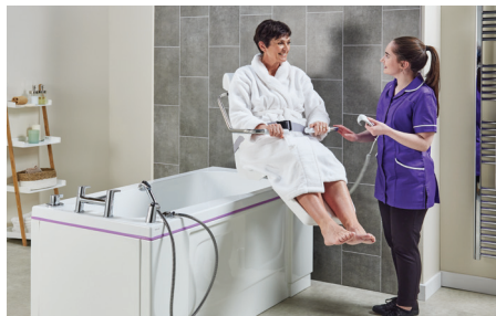
Unique leg-lift facility support the bather into and out of the bath