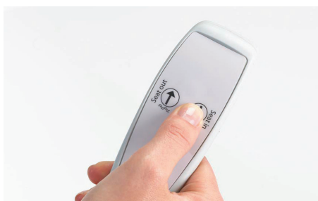
Lightweight, ergonomic handset with battery back-up system