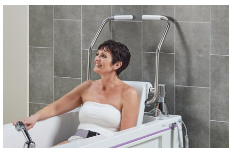
Folding nursing armrests for enhanced client safety