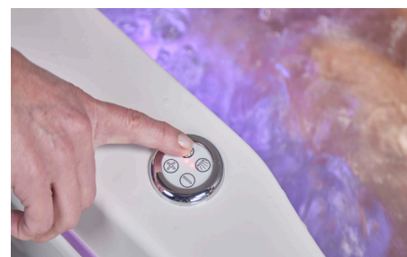
Hydrotherapy air-spa system