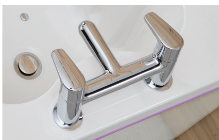
TMV3 water temperature controls reduces risk of scalding